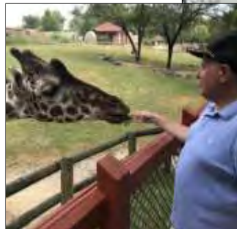
Blank Park Zoo