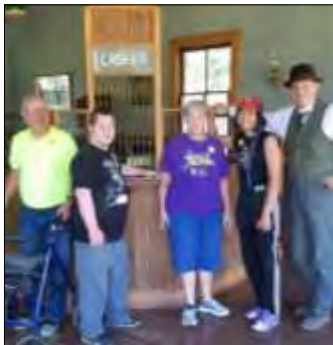
Living History Farms

We love to venture out into our community and the surrounding area, including Des Moines, where we enjoy participating in as many experiences as time and weather will allow. Thanks to everyone who has made donations to support our Core Members over the years. You have made our adventures possible.